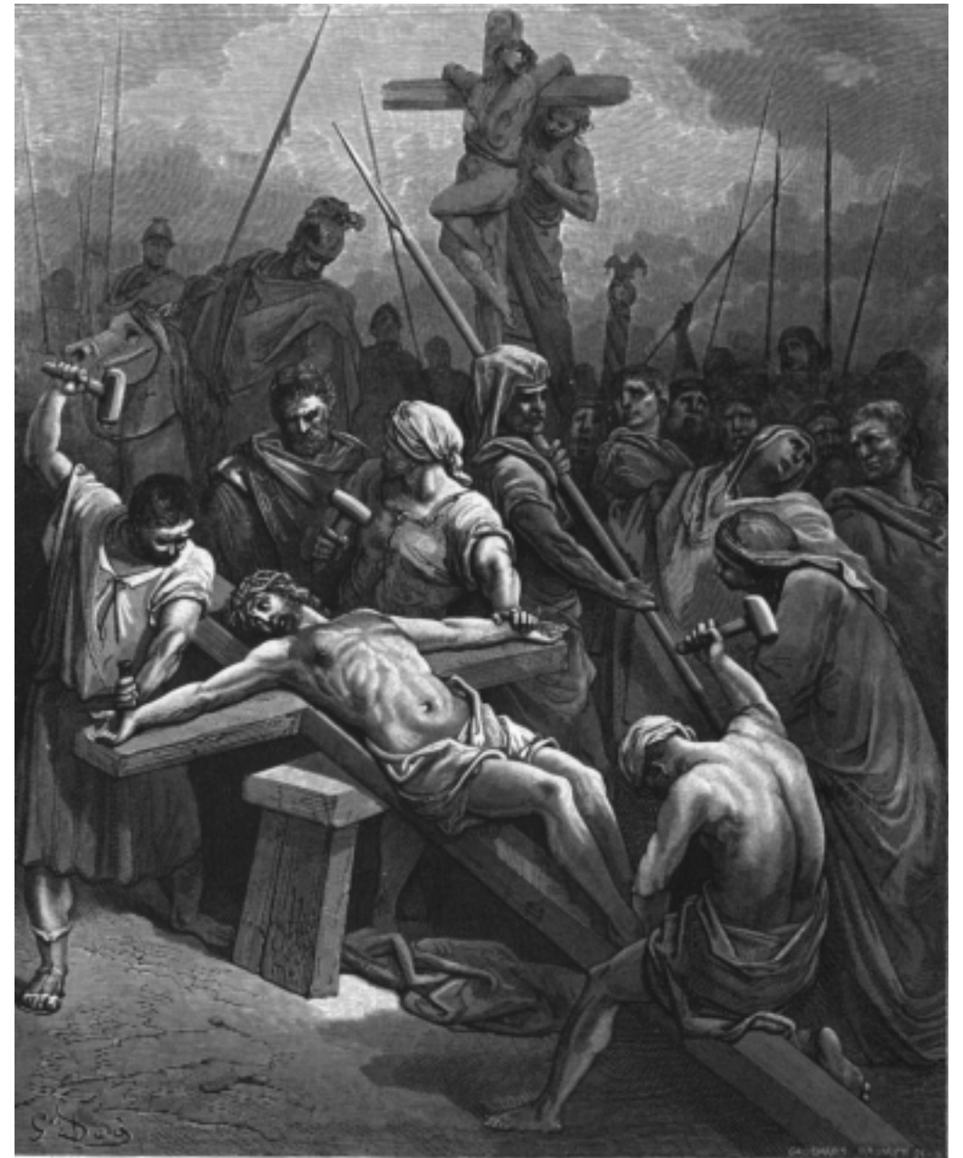
NAILING CHRIST TO THE CROSS

Where they crucified him, and two other with him, on either side one, and Jesus in the midst. . . . (John 19: 18)