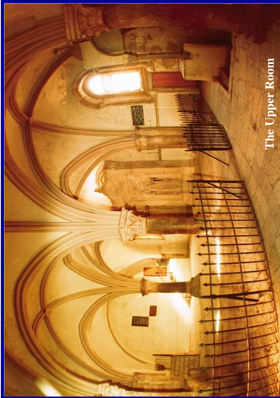
The Upper Room